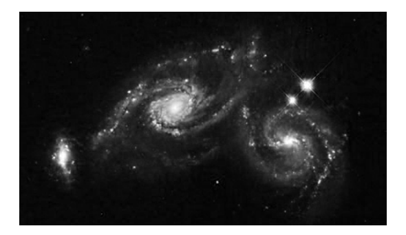
Figure 1.3: Blue color information