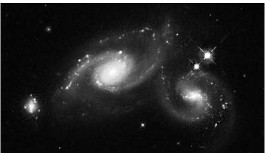
Figure 1.1: Red color information