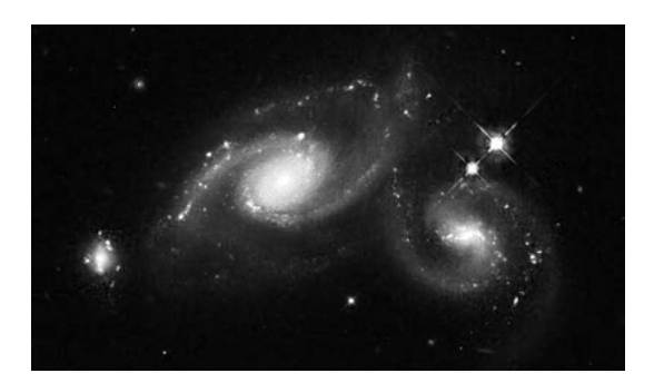
Fig. 1.1: Red color information