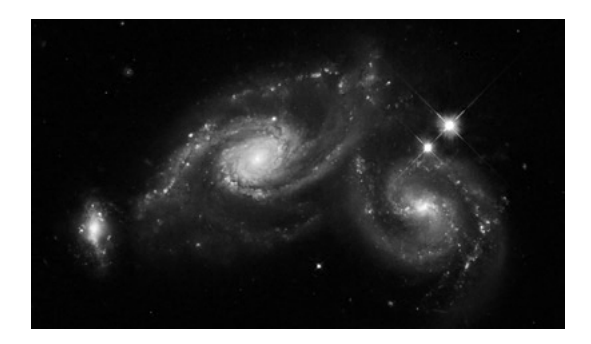
Fig. 1.2: Green color information