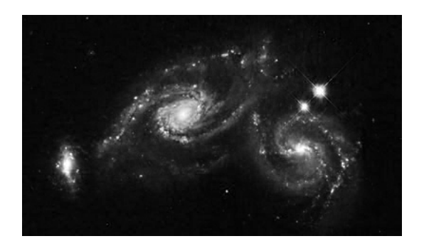
Fig. 1.3: Blue color information